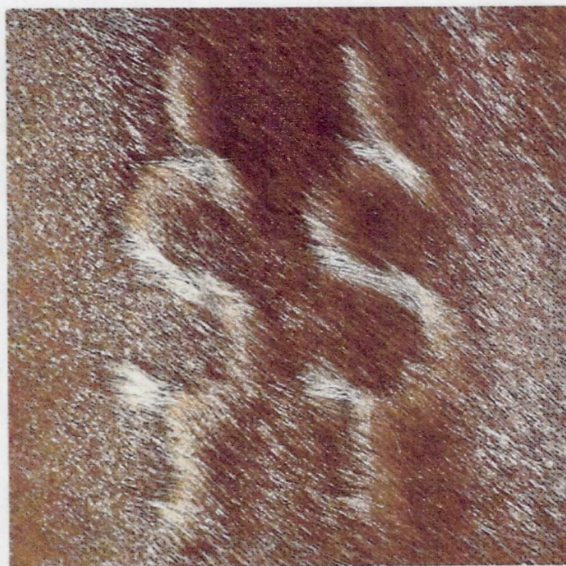
The Double Dollar brand has become a sign of a good horse and at about any roping in the West, you'll find a horse wearing it.

"Our deal is that you can't screw them up bad enough that we can't fix them in a week—if not in a couple hours. Occasionally we'll find one where that horse just doesn't want anything more to do with that person but they work for anybody else."